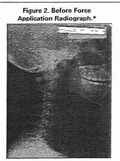
* The Radiograph was taken August 20, 1995. Cervical curve exhibited a radius of 150 cm (see Results).