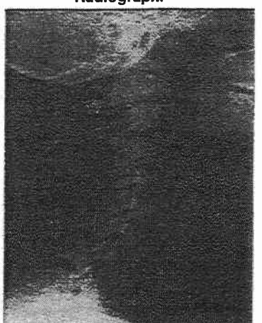
* The Radiograph was taken on September 15, 1995. Cervical curve exhibited a radius of 15 cm (see Results).